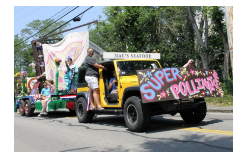
Fourth of July